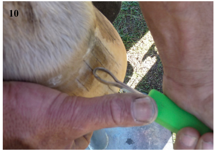
Invading infection should be opened and topically treated with an antifungal and antibacterial agent

If there is any invading infection, mostly seen as crumbly, 'cheesy' or 'stringy' material, it needs to be opened to the outside world and topically treated with an antifungal and antibacterial agent such as tea tree oil (refer to the seedy toe article in March issue of Horses and People or visit the article's archive at www.horsesandpeople.com.au ). (Photos 10,11,12)